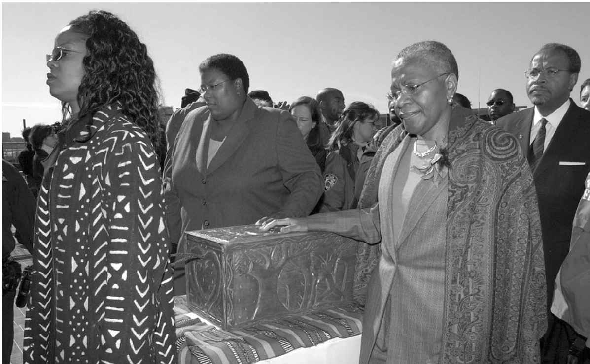
Pallbearers carry a coffin containing the remains of free and enslaved African Americans during a reburial ceremony in October 2003. Construction workers discovered the remains in 1991 when excavating a site for a new building in Manhattan.