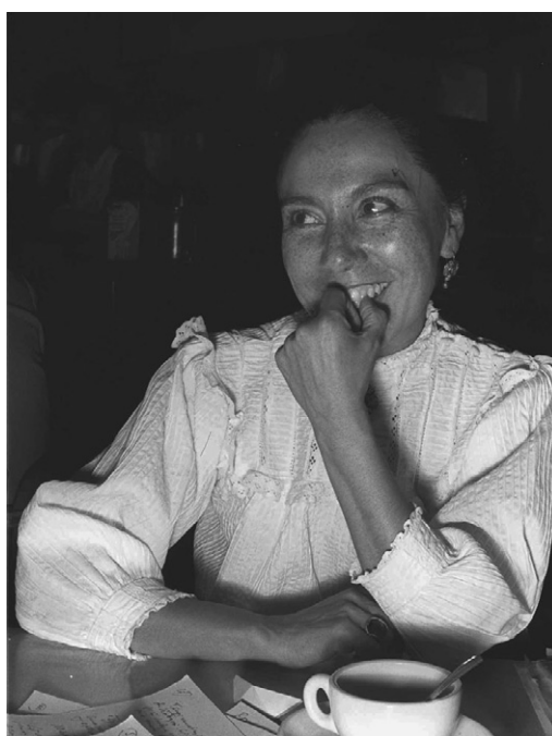
Rosaura Revueltas, who played Esperanza in the movie Salt of the Earth , in 1956.

The history of the film is as compelling as its story, because the making of the film itself stands as an example of resistance. Excerpts from the book Salt of the Earth could be a valuable supplement to showing the film. The book includes interviews and stories about the making of the film. That the government viewed the making of the movie as dangerous both amused and alarmed my students, who saw possible parallels