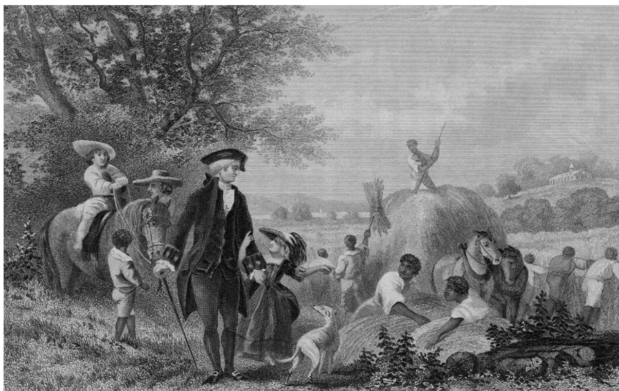
President George Washington watches over a group of black slaves working in a field at Mount Vernon.