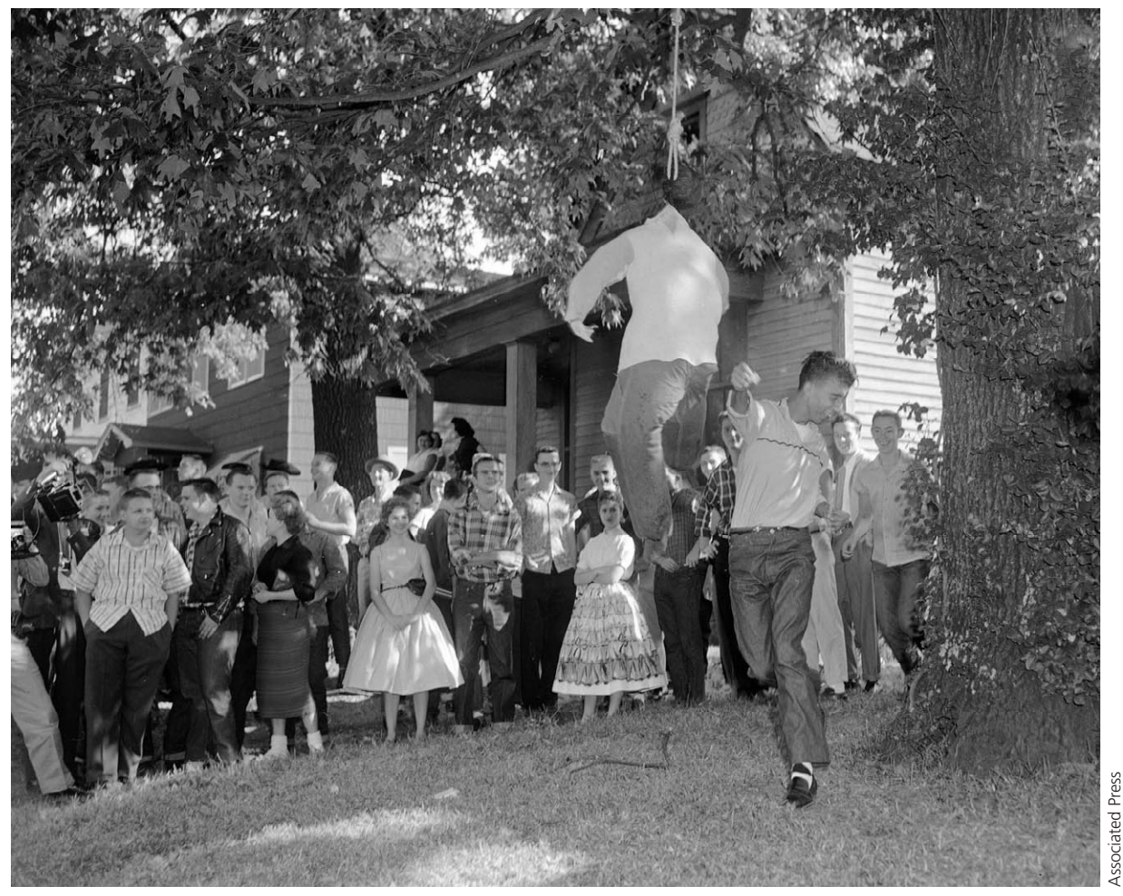
White students take turns hitting an effigy of an African American student during a 75-student walkout protesting the integration of Central High School. Soldiers policing the school grounds broke up the demonstration.