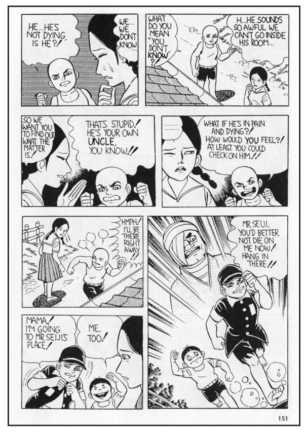
A page from Barefoot Gen: Life After the Bomb, A Cartoon Story of Hiroshima, Vol. 3. by Keiji Nakazawa © 2004.

of the atomic explosion and its aftermath to take shape on screen, in front of our eyes.