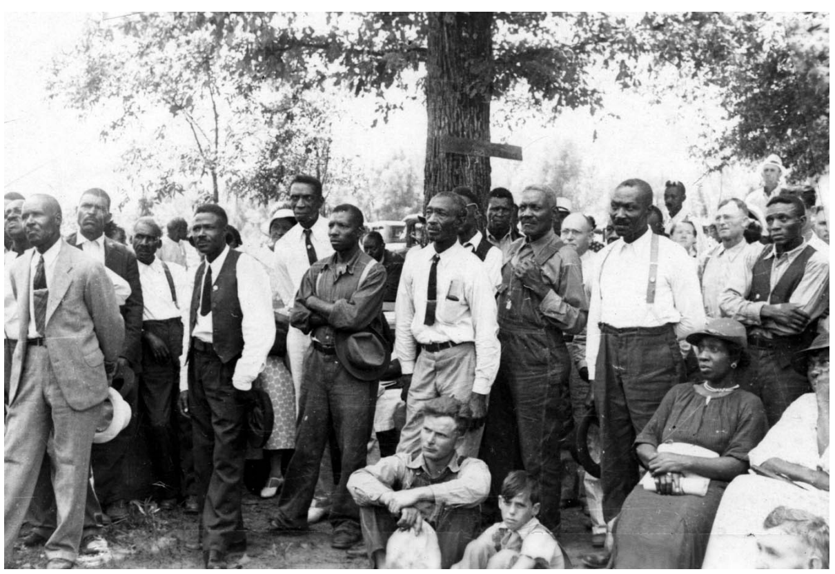
An interracial group of sharecroppers listen during a union meeting in St. Francis, Arkansas, in 1937.