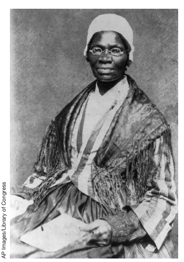
Abolitionist and women's rights activist Sojourner Truth