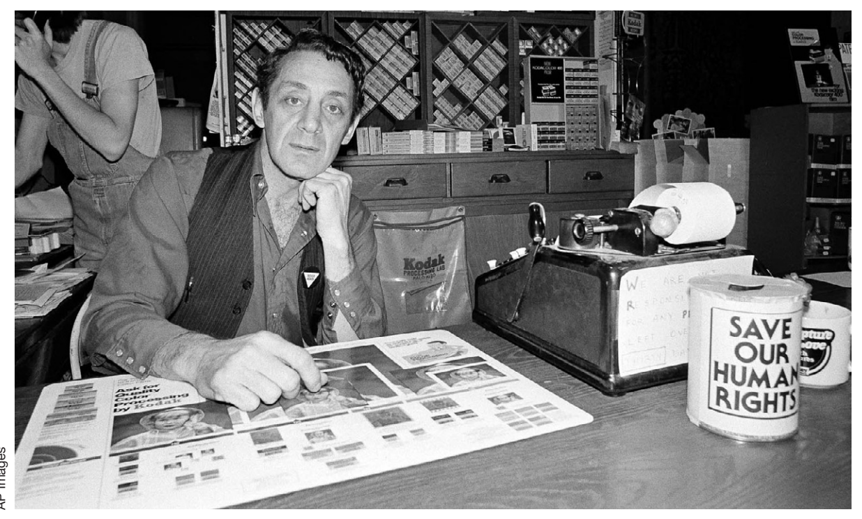
Harvey Milk was the first openly gay elected official in the United States. Milk was elected to the San Francisco Board of Supervisors in 1977. He and Mayor George Moscone were murdered in 1978 by a conservative city supervisor, Dan White.

In a myth-shattering history curriculum where heroes are regularly yanked from their pedestals, it's vital that we alert students to currents of generosity, solidarity, democracy, anti-racism, and social equality in the nation's past—and present.