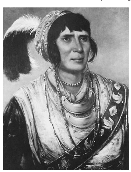
Osceola, Seminole leader, led a successful resistance of Native Americans and escaped African slaves against U.S. troops.

halfhearted Emancipation Proclamation, and persuaded Congress to pass the 13th, 14th, and 15th amendments.