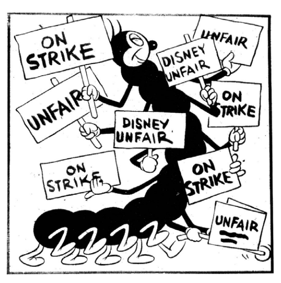
Picket sign from a protest in 1941 during a time of heightened labor unrest, when Walt Disney fired union organizers on his art staff.

The complicity of poor white people in racism, the complicity of males in sexism, is a very important issue. It seems to me that complicity can't be understood without showing the intense hardships that poor white people faced in this country, making it easier for them to look for scapegoats for their condition. You have to recognize the prob-