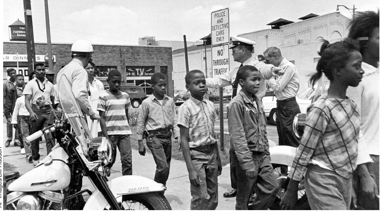
Police escort a group of black children to jail in Birmingham, Ala. on May 4, 1963. They were among the more than 900 children arrested for protesting the city's segregation laws.

The way I've tried to deal with that problem is to make it clear to the students that when we study history we are dealing with controversial issues with no one, absolute, god-like answer. And that I, as a teacher, have my opinion and they can have their opinions, and that I, as a teacher, will try to present as much information as I can but that