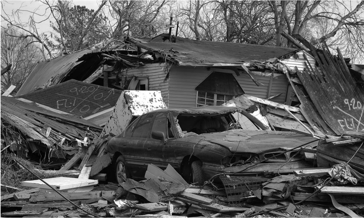
New Orleans 9th Ward six months after Katrina.

to them now, but where were all these donations before the earthquake?” Urias asked.