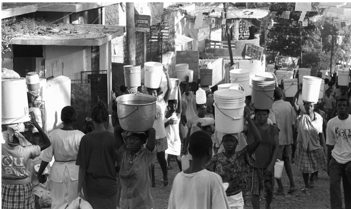
Street life Port-au-Prince, Haiti, in the years before the earthquake.

I gave students time to silently write a response to these images. “How do these images make you feel? What are your gut reactions to these images?” Students wrote for about three minutes and then we discussed their findings.